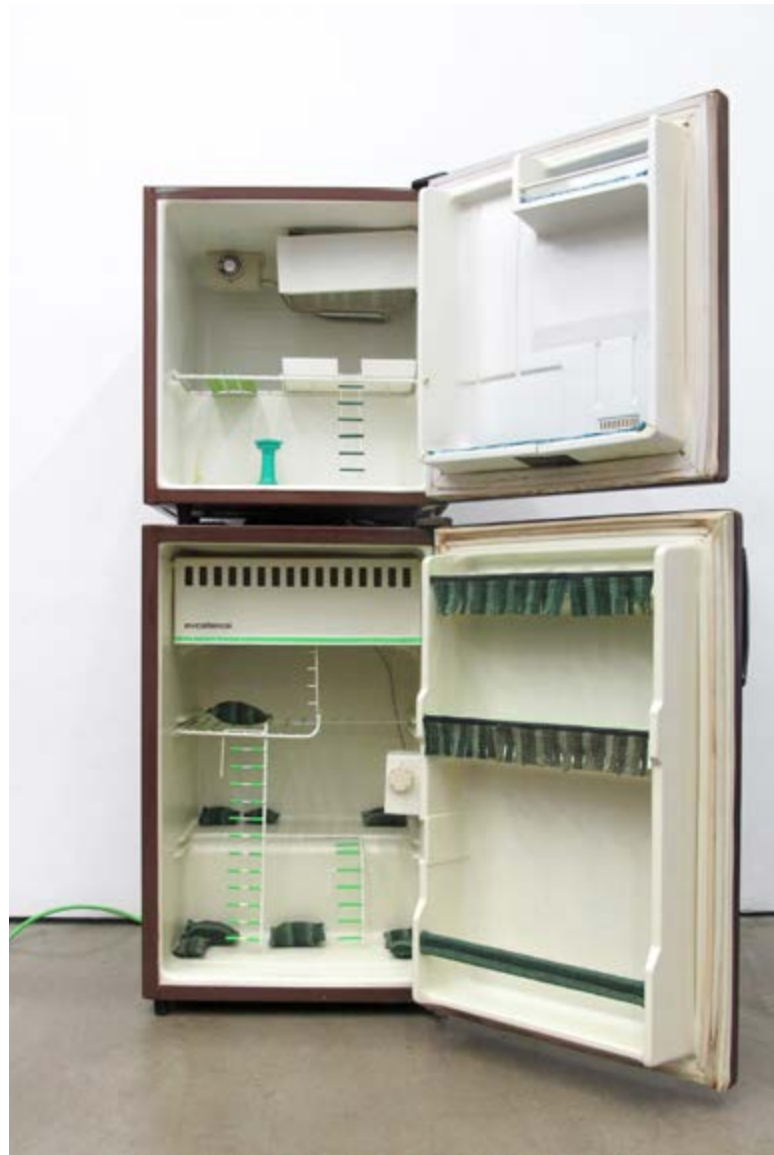
Untitled (Green II) , 2016 2 Mini-Fridges, Mixed Media 48 x 17 x 18.5 in/ 122 x 44 x 47 cm