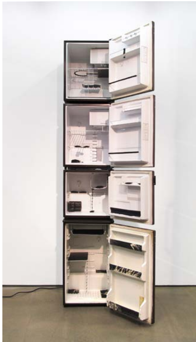
Untitled (Black) , 2016 4 Mini-Fridges, Mixed Media 101 x 19 x 18.5 in/ 257 x 48 x 47 cm