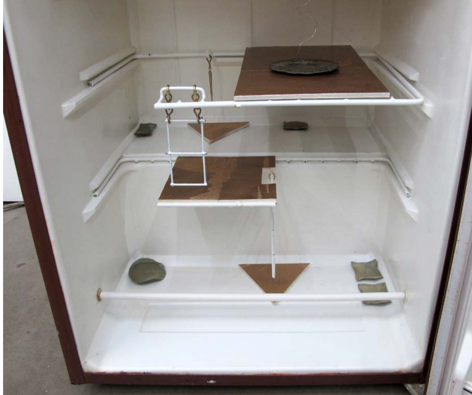
Untitled (Gold) , 2016 1 Mini-Fridge, Mixed Media 27.5 x 18 x 19.5 in/ 70 x 46 x 50 cm