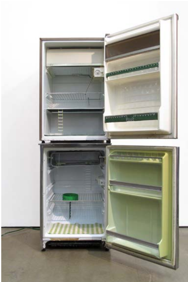
Untitled (Green I) , 2016 2 Mini-Fridges, Mixed Media 69 x 22 x 24 in/ 175 x 56 x 61 cm