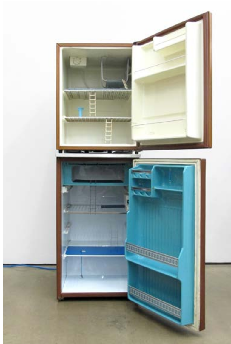
Untitled (Blue II), 2016 2 Mini-Fridges, Mixed Media 58.5 x 18 x 25 in/ 149 x 46 x 63.5 cm