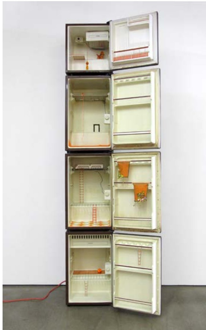
Untitled (Orange) , 2016 4 Mini-Fridges, Mixed Media 104.5 x 17.5 x 18 in/ 265 x 44 x 46 cm