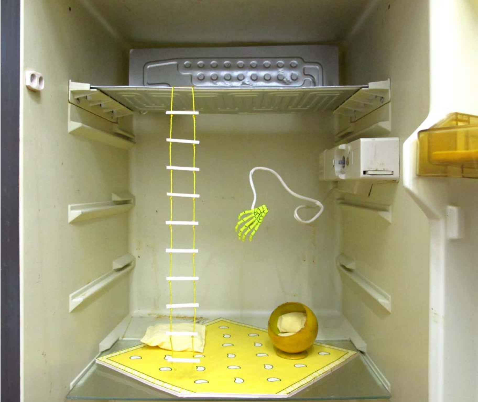
Untitled (Yellow) , 2016 2 Mini-Fridges, Mixed Media 66.5 x 19.5 x 23.5 in/ 169 x 50 x 60 cm