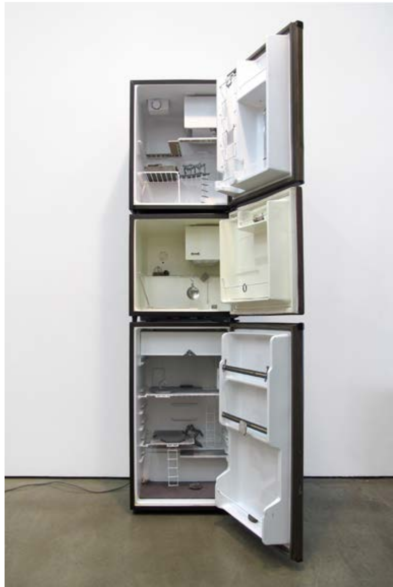
Untitled (Silver) , 2016 3 Mini-Fridges, Mixed Media 76 x 18.5 x 20 in/ 193 x 47 x 51 cm