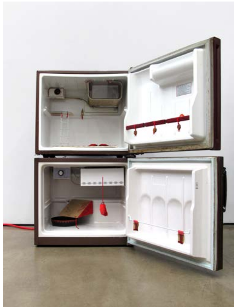
Untitled (Red III), 2016 2 Mini-Fridges, Mixed Media 36 x 21 x 19.5 in/ 122 x 44 x 47 cm