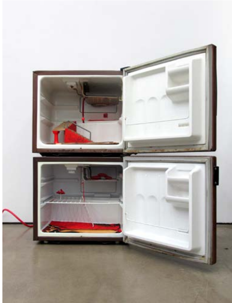
Untitled (Red II) , 2016 2 Mini-Fridges, Mixed Media 36 x 20 x 20.5 in/ 91 x 51 x 52 cm