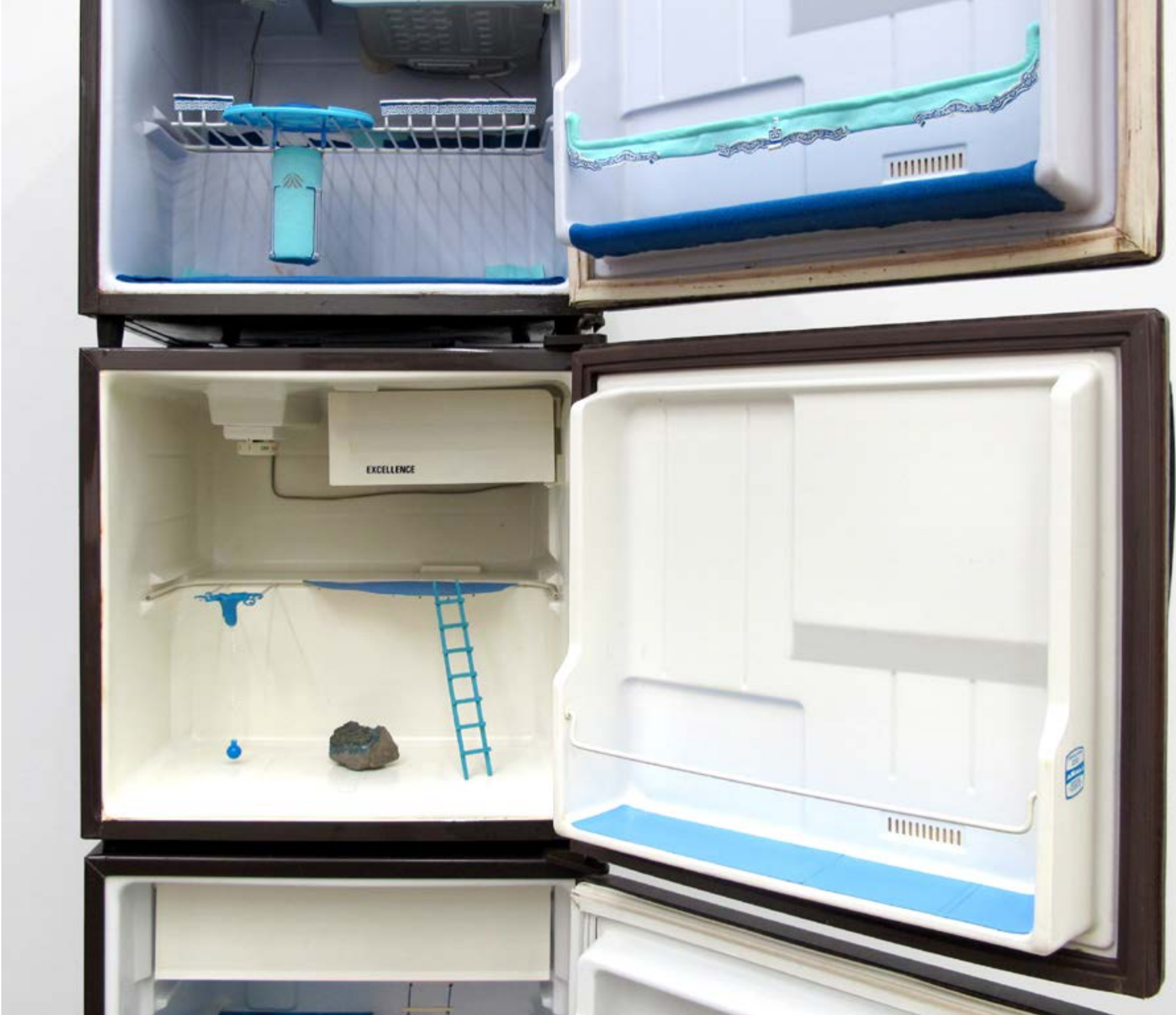
Untitled (Blue I) , 2016 3 Mini-Fridges, Mixed Media 69.5 x 18.5 x 21 in/ 177 x 47 x 53 cm