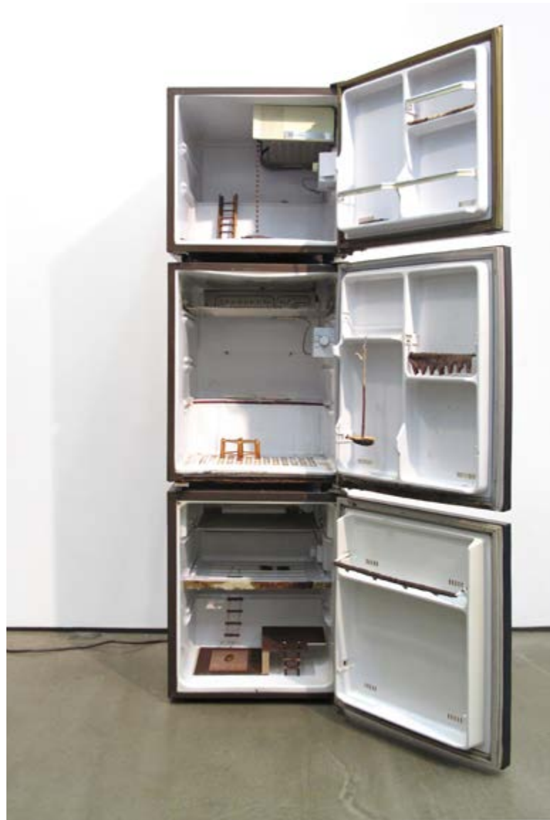
Untitled (Brown), 2016 3 Mini-Fridges, Mixed Media 64.5 x 18.5 x 22 in/ 164 x 47 x 56 cm