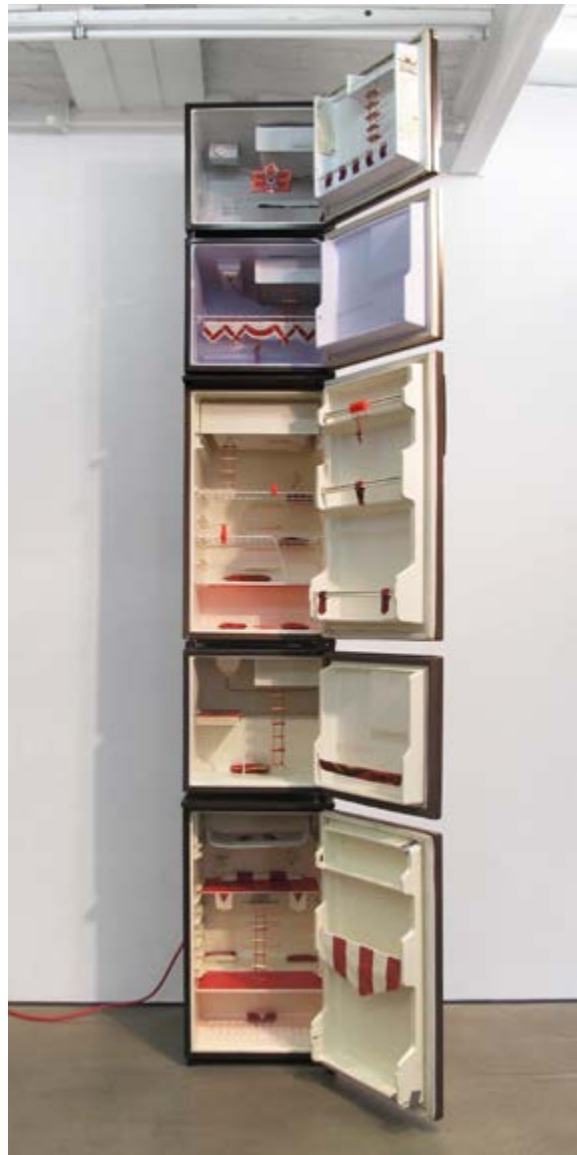
Untitled (Red I) , 2016 5 Mini-Fridges, Mixed Media 122.5 x 18.5 x 19.5 in/ 311 x 47 x 50 cm