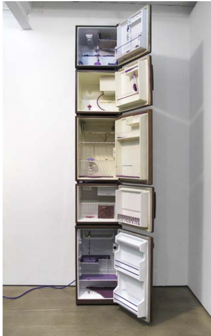
Untitled (Purple) , 2016 5 Mini-Fridges, Mixed Media 114 x 18.5 x 21.5 in/ 290 x 47 x 55 cm