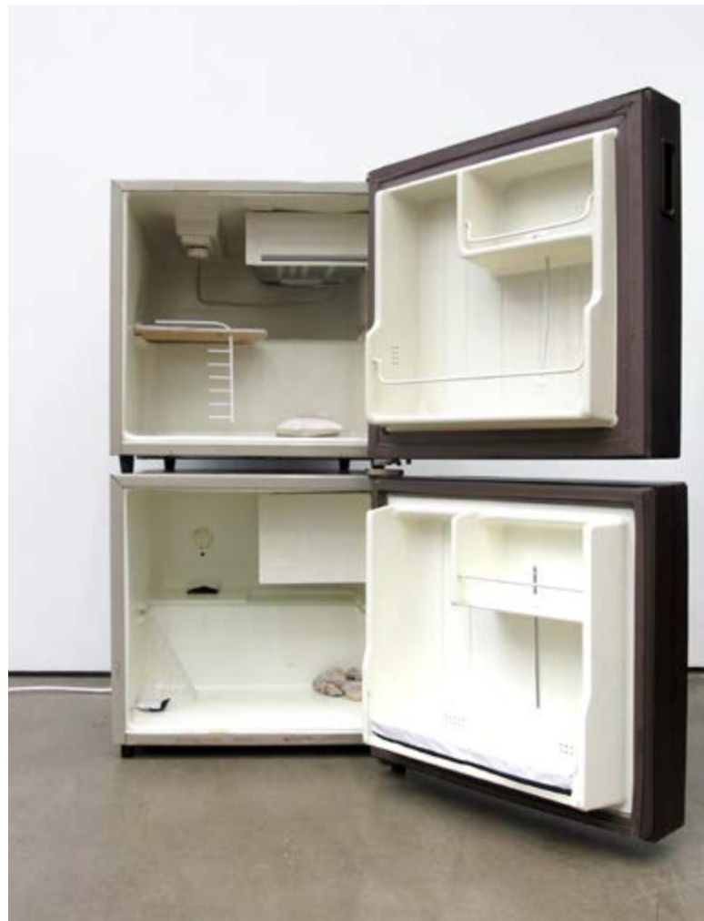
Untitled (White), 2016 2 Mini-Fridges, Mixed Media 38 x 18.5 x 22.5 in/ 97 x 47 x 57 cm