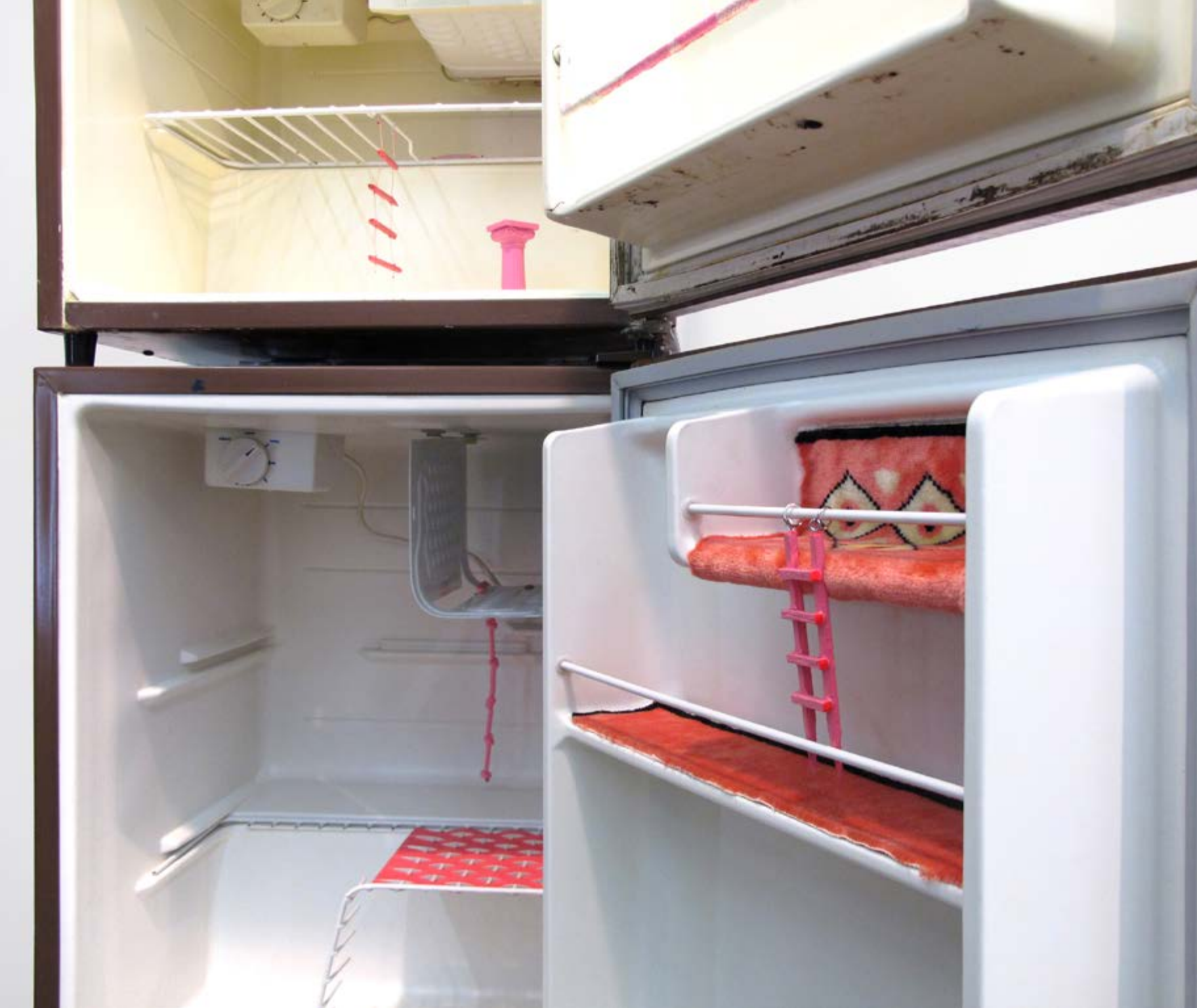
Untitled (Pink) , 2016 3 Mini-Fridges, Mixed Media 74.5 x 18.5 x 19.5 in/ 189 x 47 x 50 cm