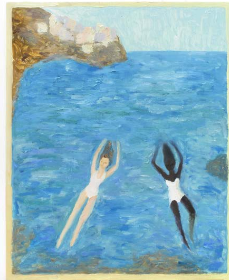
Morning Swimmers , 2016 Oil on canvas 27 x 22 in/ 69 x 56 cm

Next page: Off the Coast of , 2016 Oil on canvas 84 x 108 in/ 213 x 274 cm