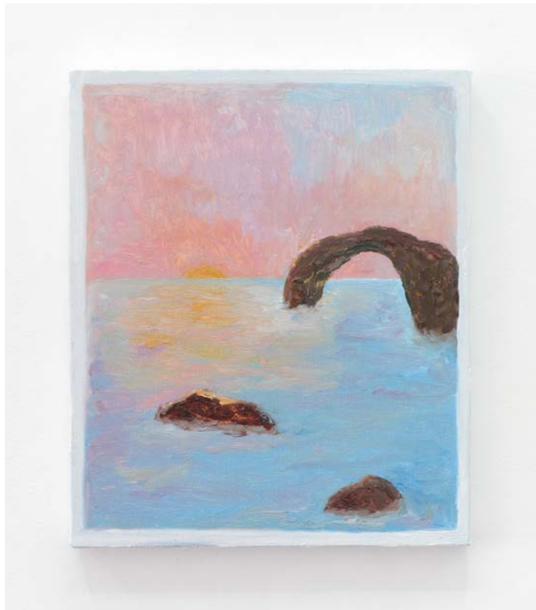
Rocks and Sunset , 2016 Oil on canvas 18 x 15 in/ 46 x 38 cm