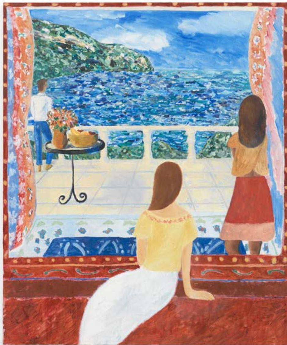
Still , 2016 Oil on canvas 72 x 60 in/ 183 x 152 cm