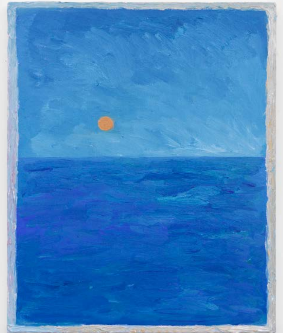
Sun , 2016 Oil on canvas 27 x 22 in/ 69 x 56 cm