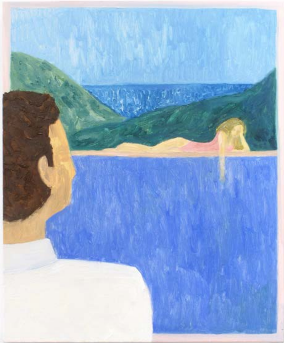
The Object of My Affection , 2016 Oil on canvas 27 x 22 in/ 69 x 56 cm