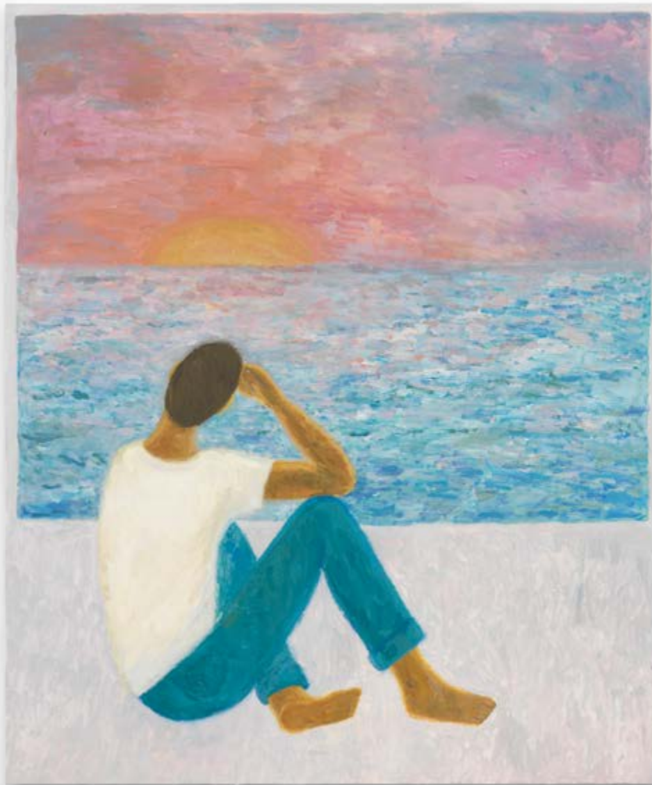
Sunset , 2016 Oil on canvas 72 x 60 in/ 183 x 152 cm