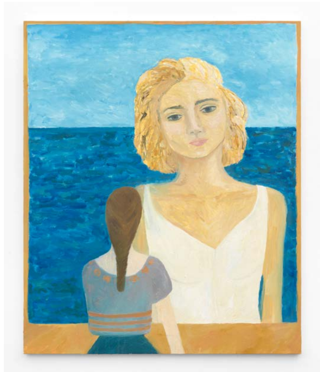
Close Up , 2016 Oil on canvas 54 x 45 in/ 137 x 114 cm