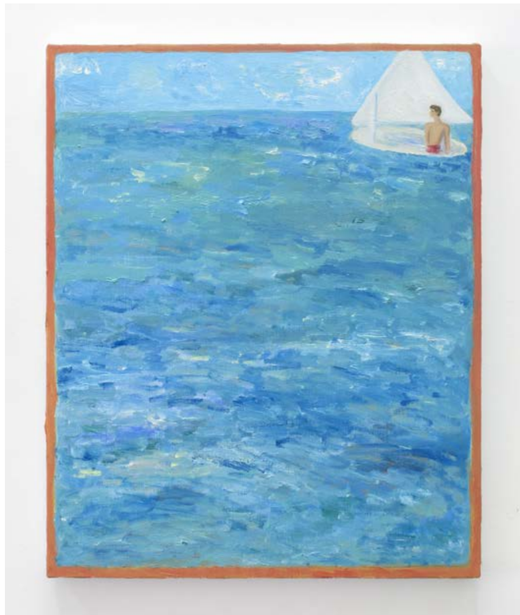
Odysseus , 2016 Oil on canvas 27 x 22 in/ 69 x 56 cm