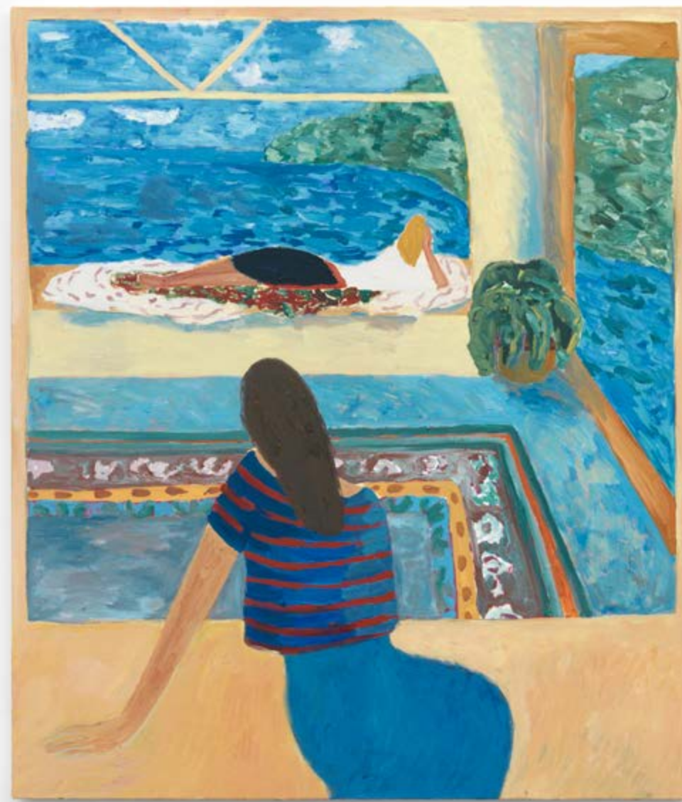
Windows , 2016 Oil on canvas 54 x 45 in/ 137 x 114 cm