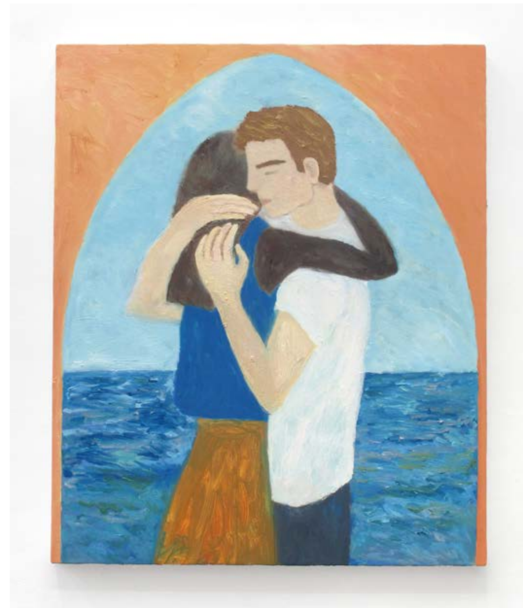
Embrace , 2016 Oil on canvas 36 x 30 in/ 91 x 76 cm