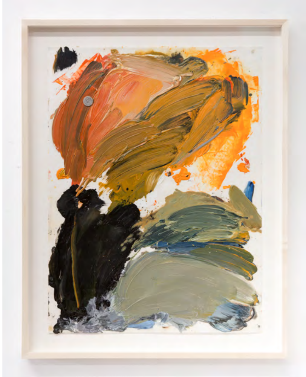
Mr. San Peppy, 2017 Oil on paper, framed 28 x 22 x 1.75 in/71 x 56 x 4 cm