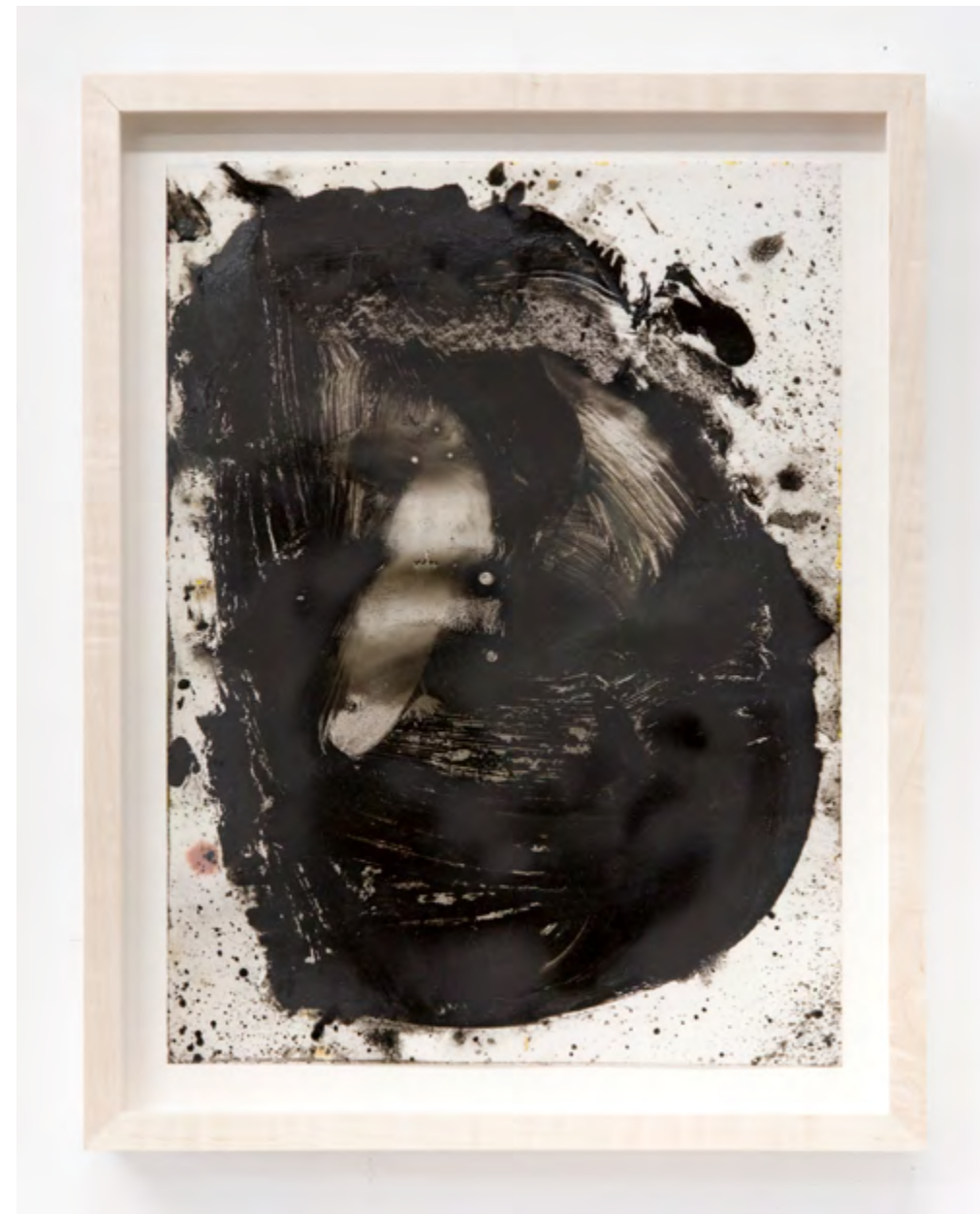
The Blacksmith, 2017 Oil on paper, framed 14 x 11 x 1.75 in/36 x 28 x 4 cm