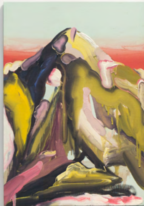
Mt. Wilson (Santa Ana II), 2017 Oil on canvas 31.5 x 22 in / 80 x 56 cm