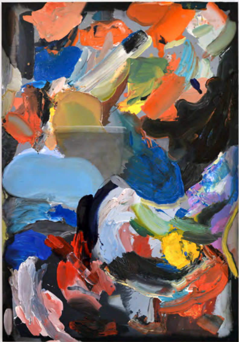
Santa Ana, 2017 Oil on canvas 78 x 54 in/198 x 137 cm