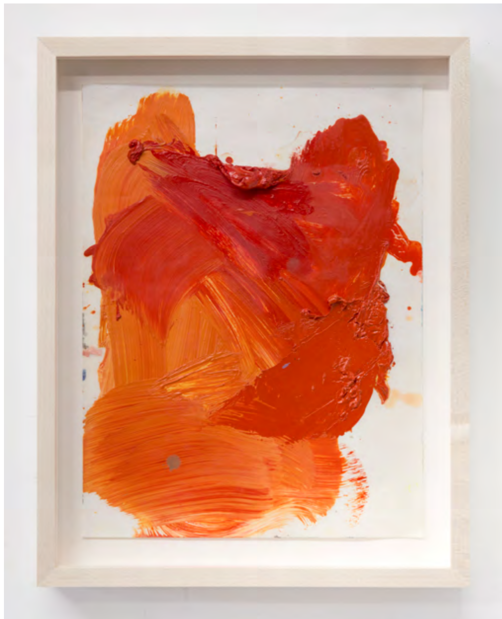
Little Peppy, 2017 Oil on paper, framed 14 x 11 x 1.75 in/36 x 28 x 4 cm