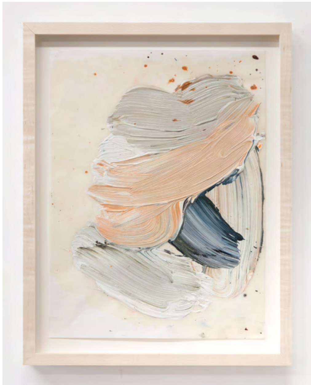
Grays Starlight, 2017 Oil on paper, framed 14 x 11 x 1.75 in/36 x 28 x 4 cm