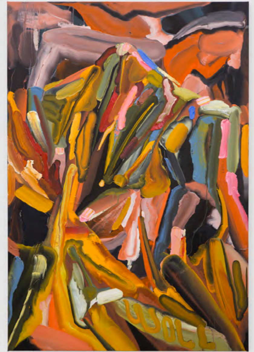
Mt. Wilson (Calliope), 2017 Oil on linen 54 x 37.5 in/137 x 95 cm