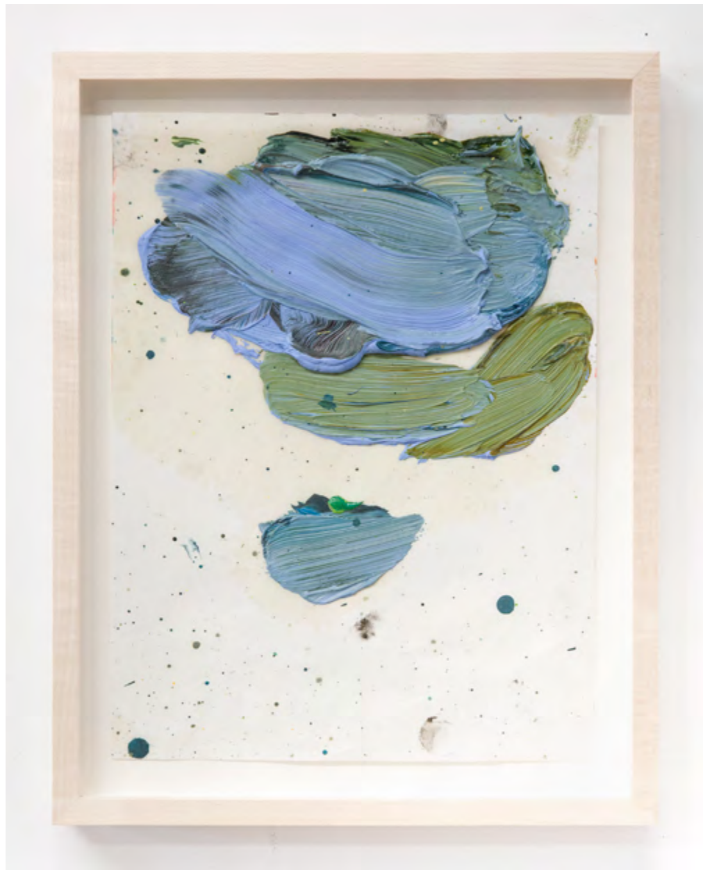
Drought, 2017 Oil on paper, framed 14 x 11 x 1.75 in/36 x 28 x 4 cm