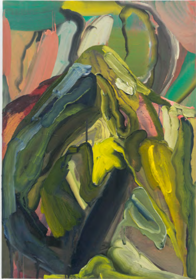
Mt. Wilson (Santa Ana IV), 2017 Oil on canvas 31.5 x 22 in / 80 x 56 cm