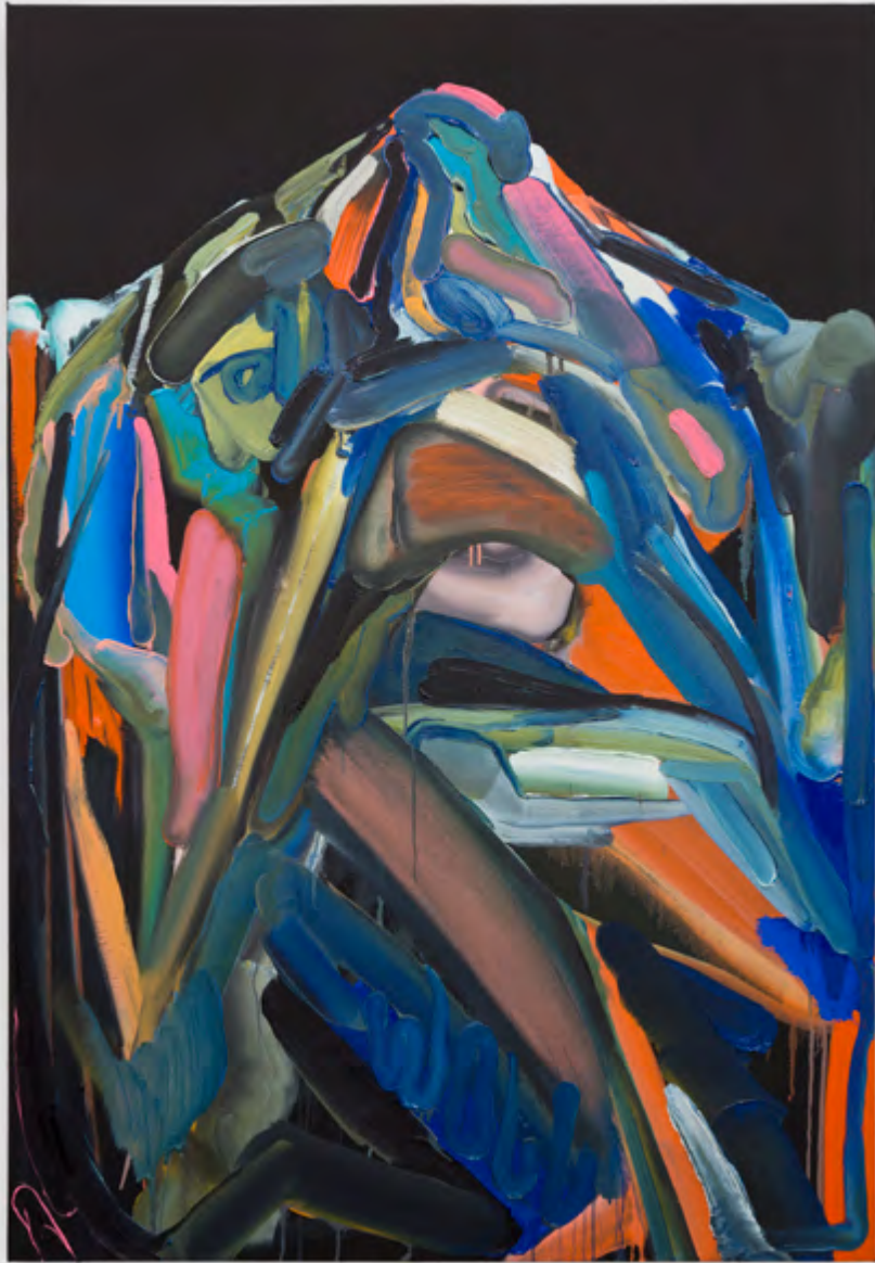
Mt. Wilson (Antissan III), 2017 Oil on linen 54 x 37.5 in/137 x 95 cm