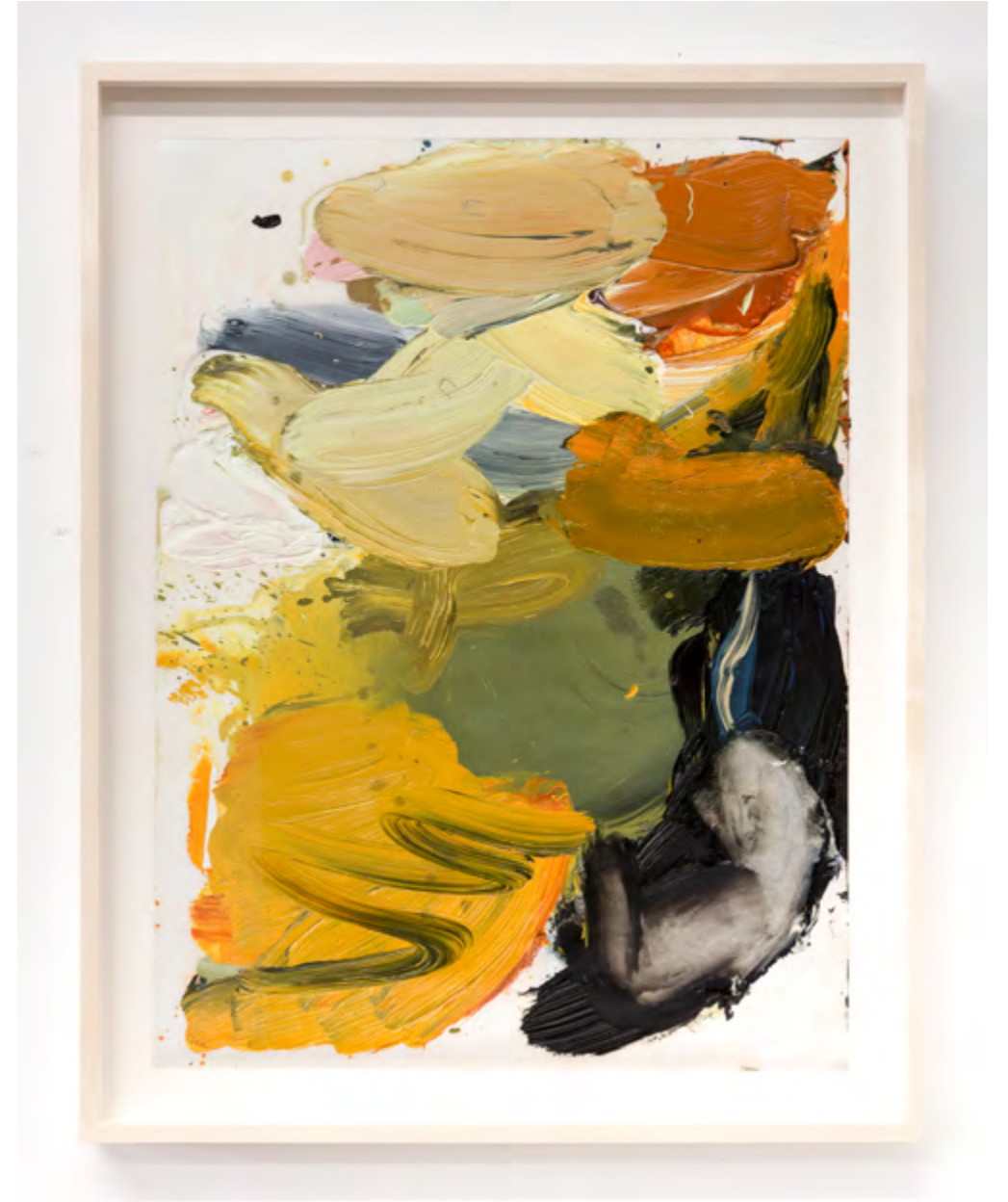
A Shade Peppy, 2017 Oil on paper, framed 28 x 22 x 1.75 in / 71 x 56 x 4 cm