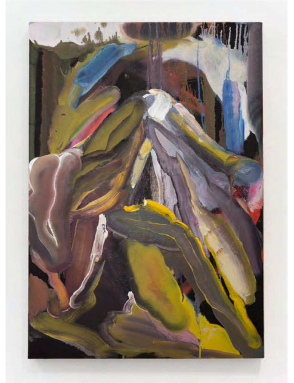
Mt. Wilson (Santa Ana III), 2017 Oil on canvas 31.5 x 22 in / 80 x 56 cm