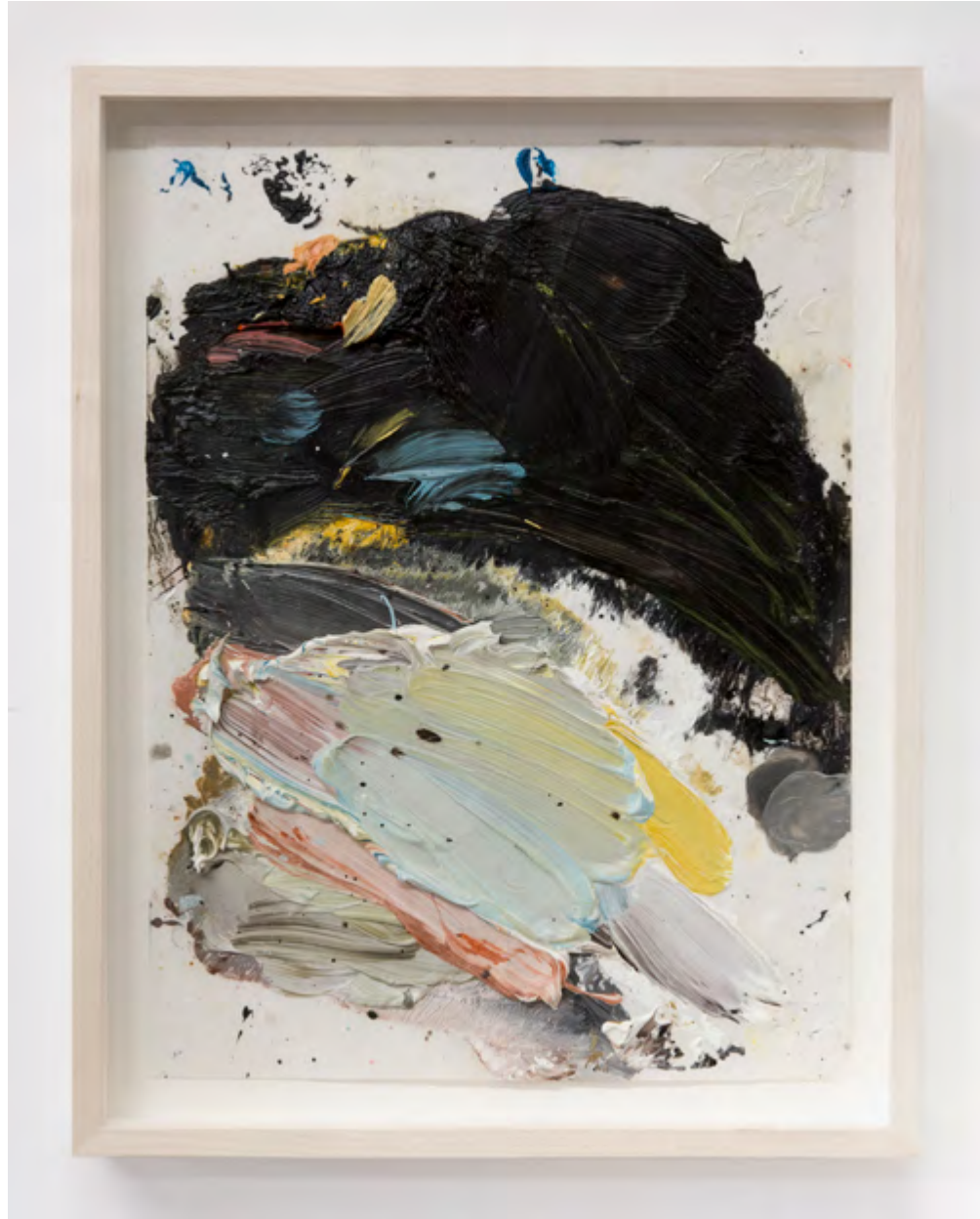
Santa Anita, 2017 Oil on paper, framed 18.25 x 14.25 x 1.75 in/46 x 36 x 4 cm