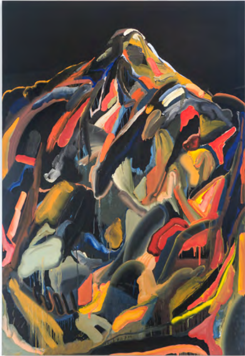
Mt. Wilson (Santa Ana I), 2017 Oil on linen 96 x 66 in / 244 x 168 cm