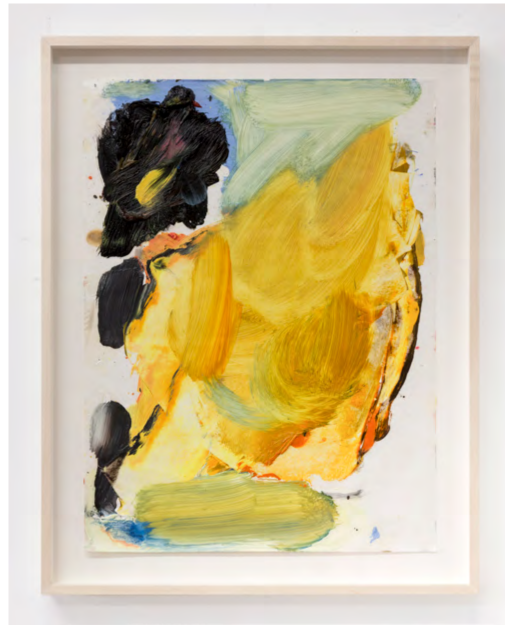
Peppy Belle, 2017 Oil on paper, framed 28 x 22 x 1.75 in/71 x 56 x 4 cm