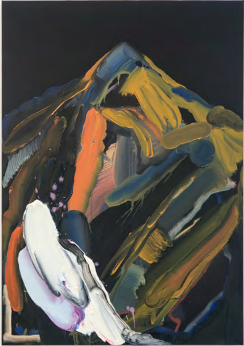
Mt. Wilson (Santa Ana V), 2017 Oil on canvas 31.5 x 22 in / 80 x 56 cm