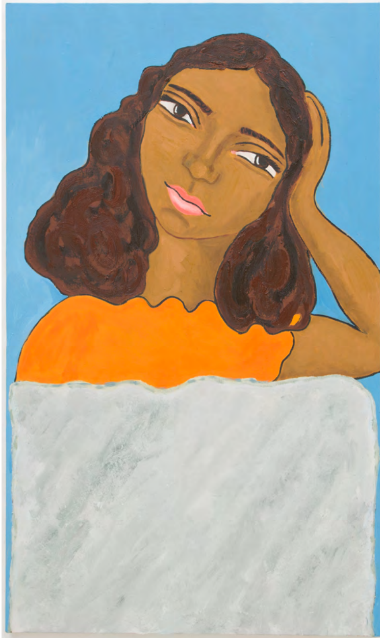
Sculpture , 2018 Oil on canvas 49 1/2 x 30 1/2 in/125.73 x 77.47 cm