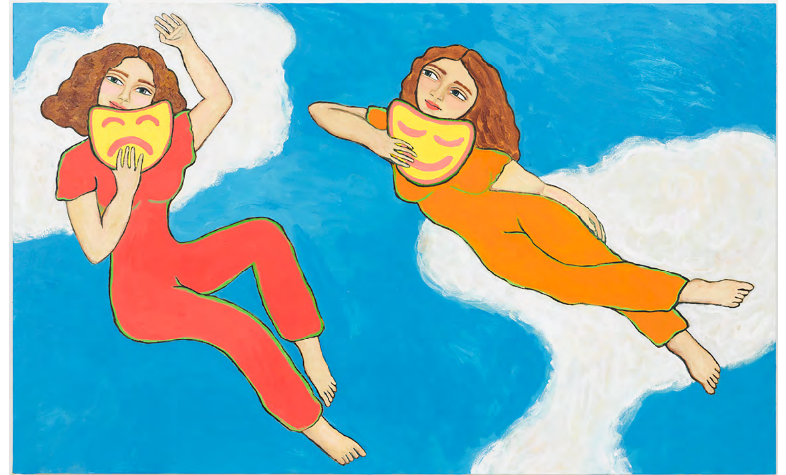
Comedy and Tragedy , 2018 Oil on canvas 49 1/2 x 80 in/125.73 x 203.2 cm