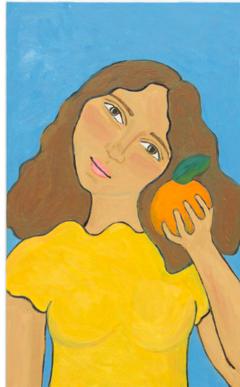
Agriculture with Orange , 2018 Oil on canvas 30 x 19 in/76.2 x 48.26 cm