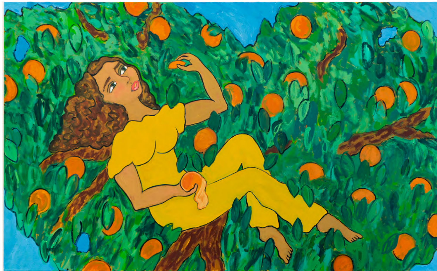
Agriculture , 2018 Oil on canvas 49 1/2 x 80 in/125.73 x 203.2 cm