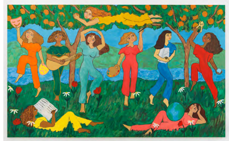
Jessie Edelman, Muse Pantheon , 2018, Oil on canvas, 80 x 130 in/203.2 x 330.2 cm

necessity, yet Edelman's paintings remind us that disrupting and repositioning the cultural narratives that promote inequality is also an artistic obligation. With her new series, Edelman cleverly twists the creative myth of the muse into new gender realignment, but also creates a feminist coming of age story. In her introduction to Wet , Schor writes “A maverick position is sometimes harder to commodify than a dogmatic party line, but it can be inclusive and usefully speculative.” 4 By remaking and reembracing a classic motif, Edelman has become Schor's maverick.