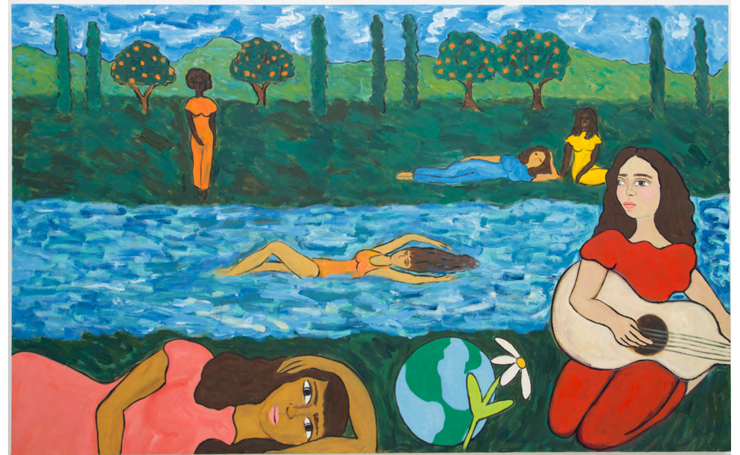
Playful Muses , 2018 Oil on canvas 49 1/2 x 80 in/125.73 x 203.2 cm