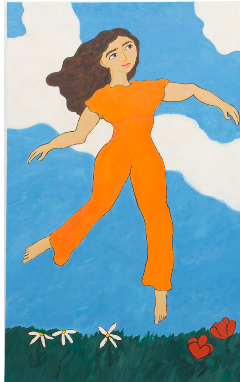
Dance , 2018 Oil on canvas 80 x 49 1/2 in/203.2 x 125.73 cm