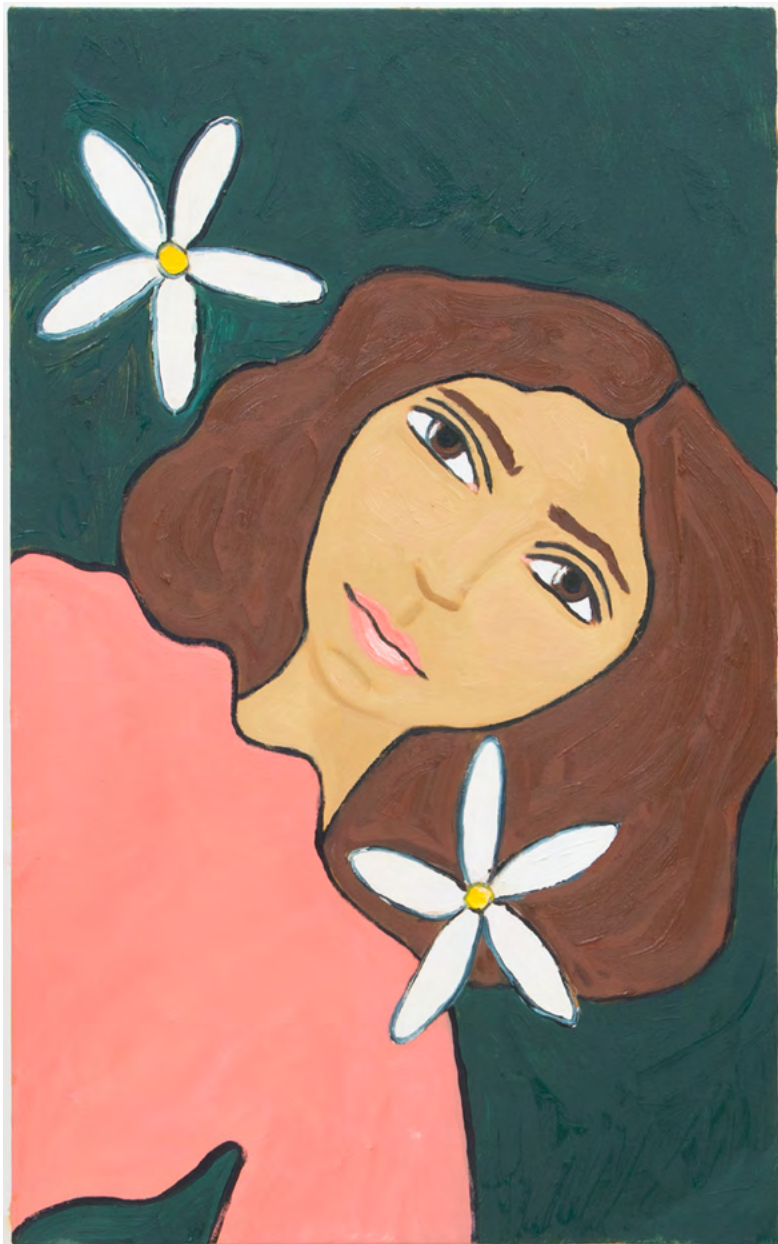
Muse with Two Flowers , 2018 Oil on canvas 30 x 19 in/76.2 x 48.26 cm