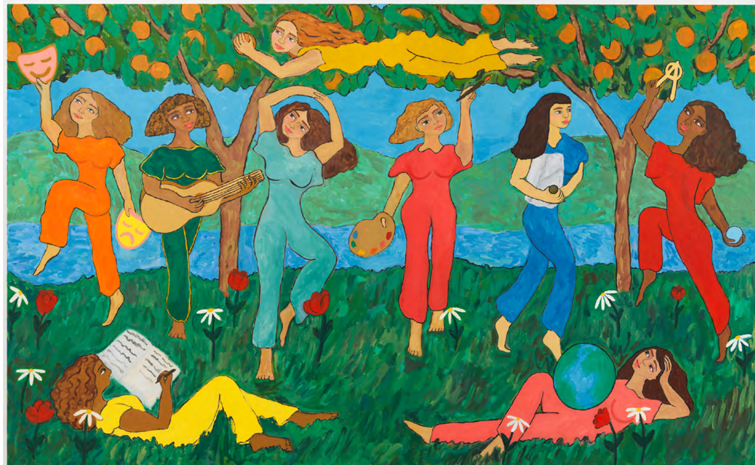
Muse Pantheon , 2018 Oil on canvas 80 x 130 in/203.2 x 330.2 cm