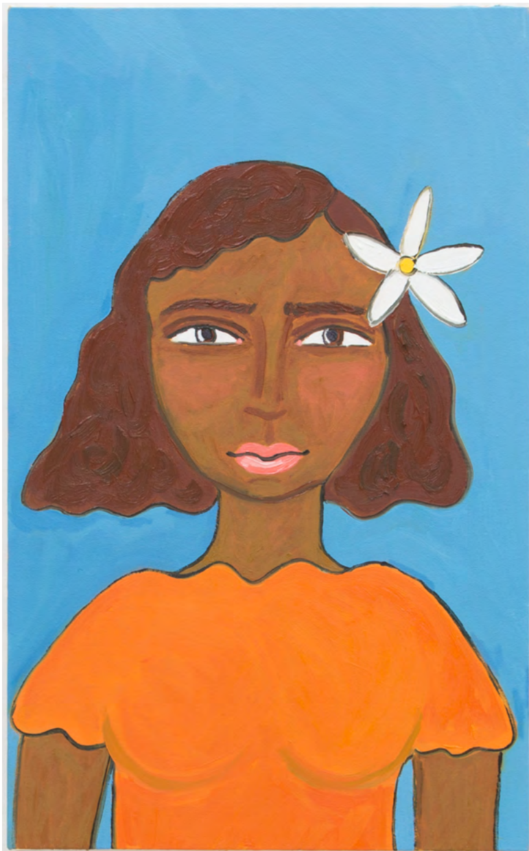
Muse with Flower in Her Hair , 2018 Oil on canvas 30 x 19 in/76.2 x 48.26 cm