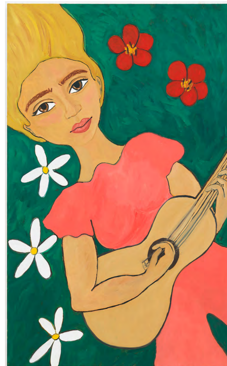
Music , 2018 Oil on canvas 80 x 49 1/2 in/203.2 x 125.73 cm