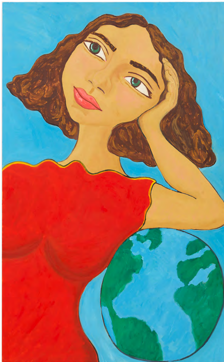
History , 2018 Oil on canvas 80 x 49 1/2 in/203.2 x 125.73 cm