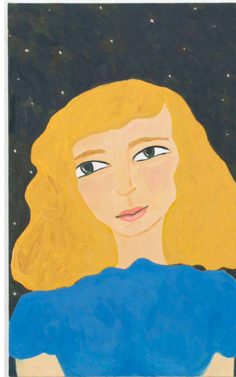
Astronomy , 2018 Oil on canvas 30 x 19 in/76.2 x 48.26 cm